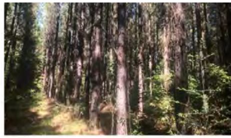
11 Yr. Old Bareroot MCP Elite Stand in AL: 90% Sawtimber Potential 3x the Value of the OP Container Stand

“Just because it’s in a container, doesn’t mean the genetics are better.”