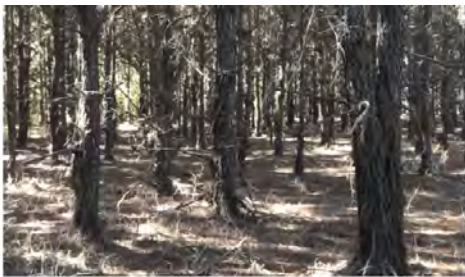
10 Yr. Old Container 2nd gen stand in SC: high number of defective trees: crooks, forks, rust galls 35% SawTimber Potential