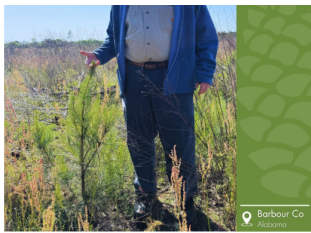
MCP® at 1 year Barbour County, AL