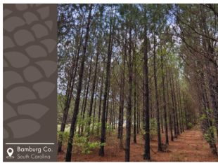
MCP® Elite at 10 years Bamberg County, SC